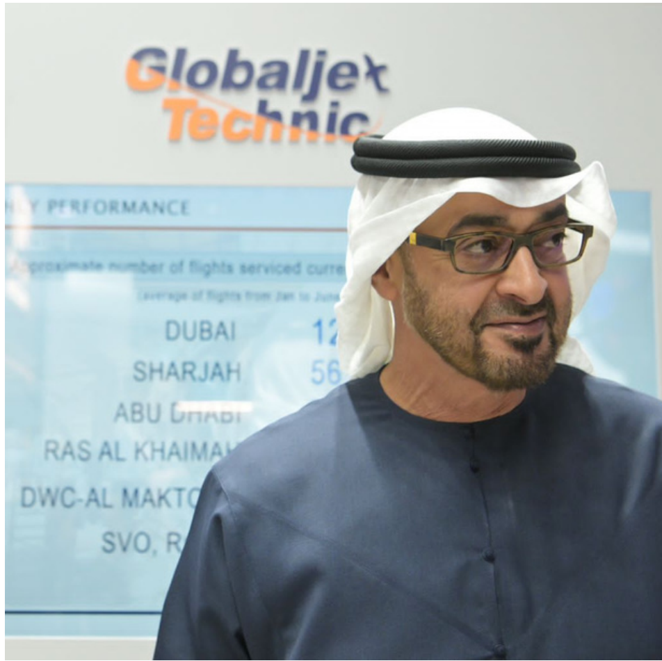
(Picture of His Highness Sheikh Mohamed bin Zayed Al Nahyan, President of UAE and Ruler of Abu Dhabi at Globaljet Technic's Moscow facility)

His Highness Sheikh Mohamed bin Zayed Al Nahyan, President of UAE and Ruler of Abu Dhabi graced us with his august visit to our facility at Moscow. The visit marked a testament to the dedication of Globaljet Technic and showcased the strategic importance of the Globaljet Technic facility in the realm of aviation. The facility's state-of-the-art infrastructure, cutting-edge technologies, and commitment to excellence in aircraft maintenance, and repair, were on full display, underscoring its pivotal role in the field of aviation.